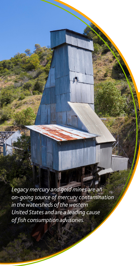
Legacy mercury and gold mines are an on-going source of mercury contamination in the watersheds of the western United States and are a leading cause of fish consumption advisories.