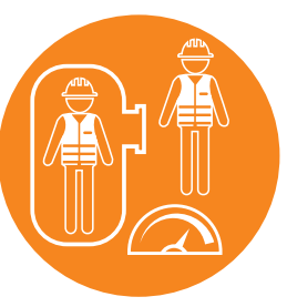
permit prior to entering confined spaces.